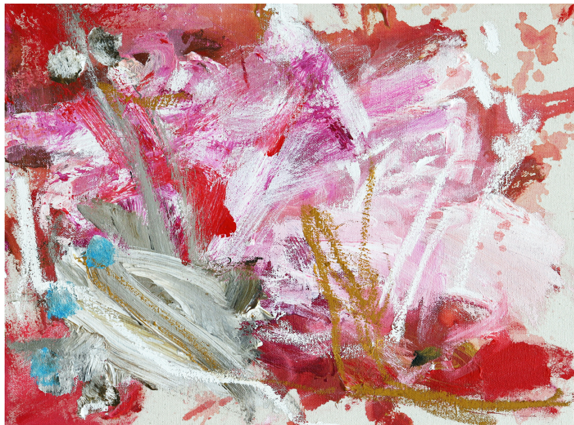
Magnus Young-Holborow, The OG, 2022 Acrylic and pigment stick on canvas, 33x44cm, framed $320