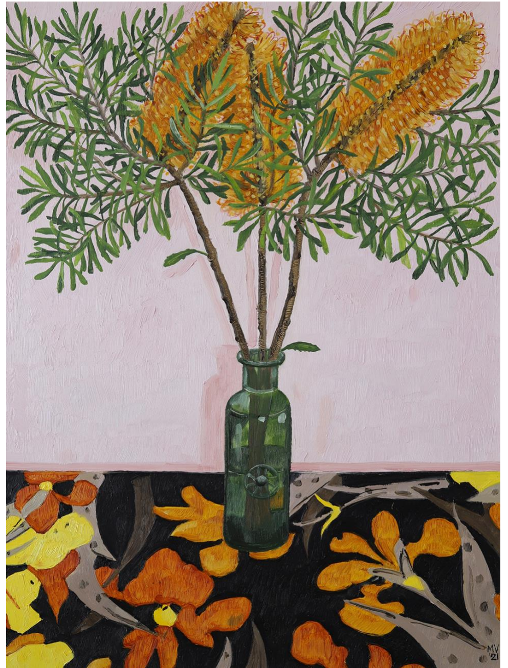
Melanie Vugich, Three Banksias & Autumn Beauty , 2021 Oil on board, 60x45cm framed in raw white oak. $1850