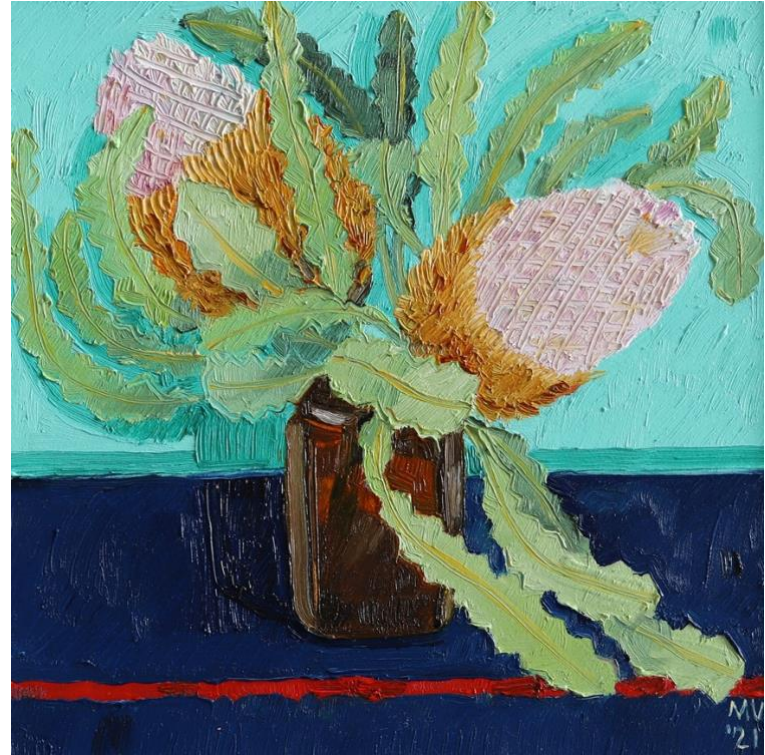
Melanie Vugich, Banksia Victoriae on Blue , 2021 Oil on board, 20x20cm framed in raw white oak.