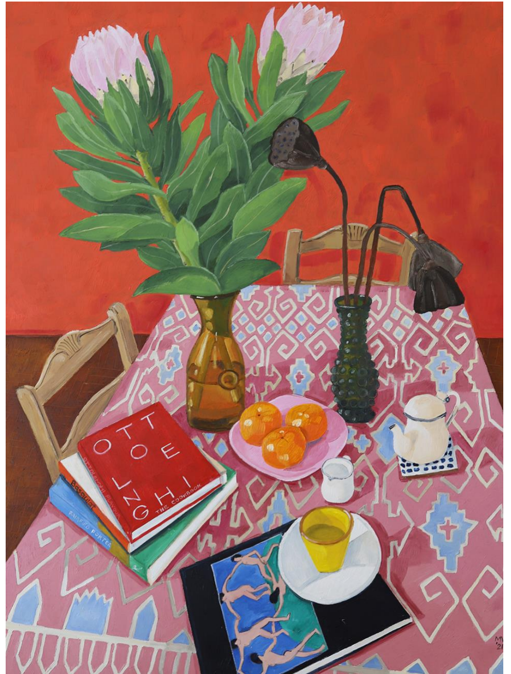
Melanie Vugich, Daydreamy Afternoons at Alfred Street , 2021 Oil on board, 100x75cm framed in raw white oak. $3200