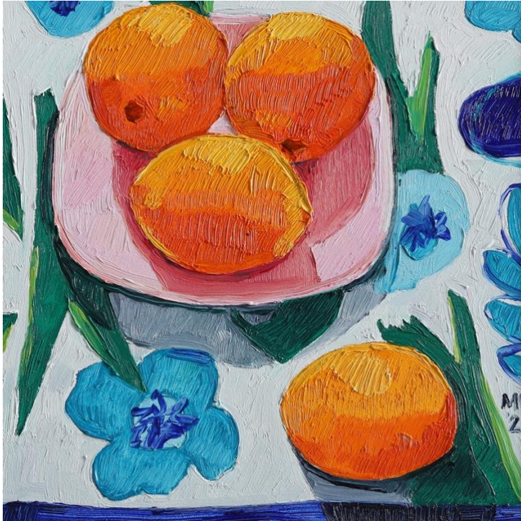
Melanie Vugich, Oranges & Italian Memories , 2021 Oil on board, 20x20cm framed in raw white oak.