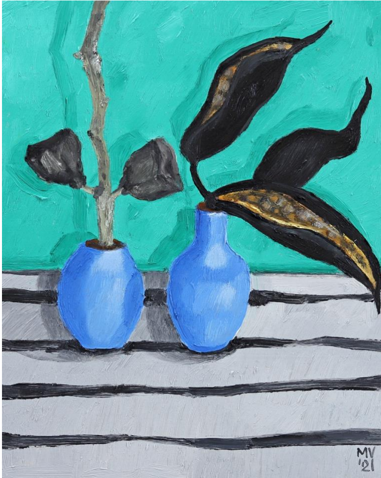
Melanie Vugich, Wagga Wagga Seed Pods & Fresh Hues , 2021 Oil on board, 25x20cm framed in raw white oak. $950