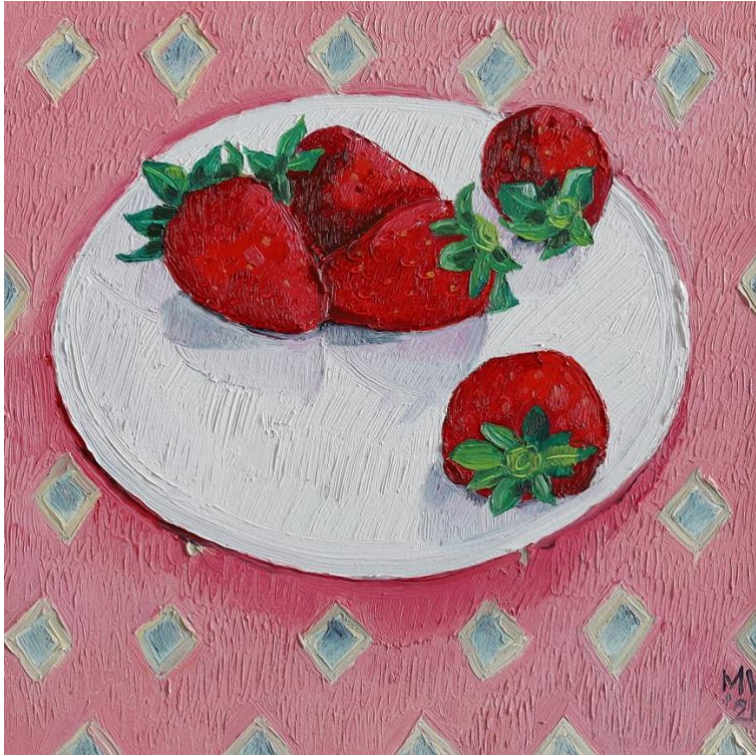
Melanie Vugich, Five Strawberries for My Love , 2021 Oil on board, 20x20cm framed in raw white oak.