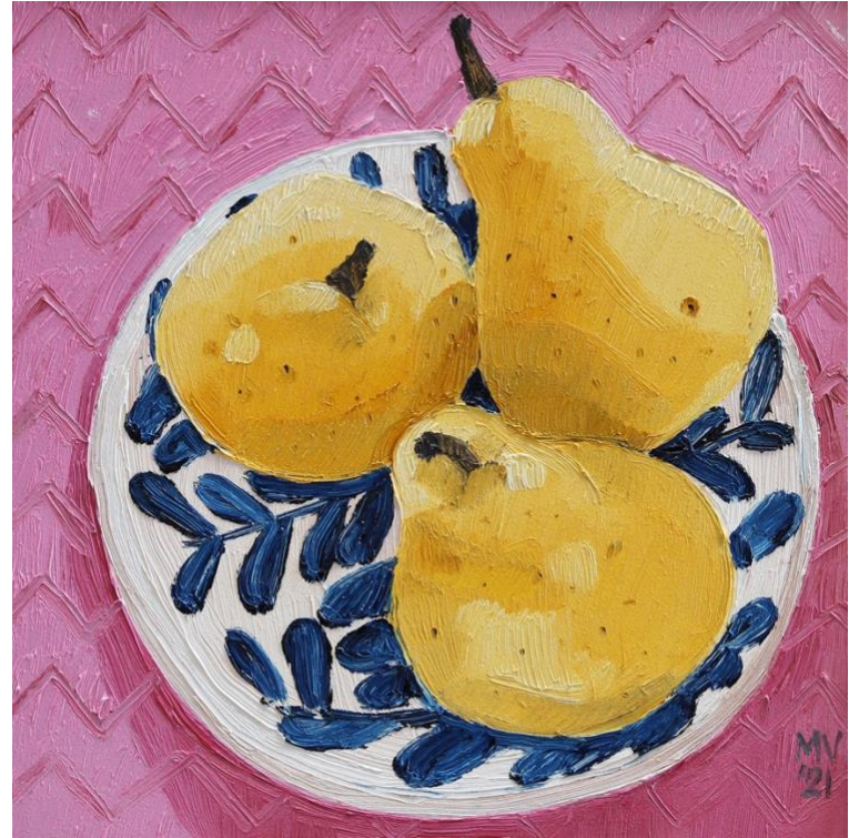
Melanie Vugich, Ripe Bartlett Pears on Pink , 2021 Oil on board, 20x20cm framed in raw white oak.