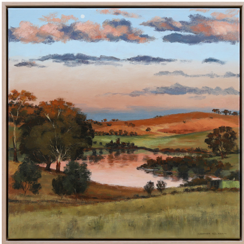
Chasing The Sunset Acrylic on canvas, 48x48cm framed $710