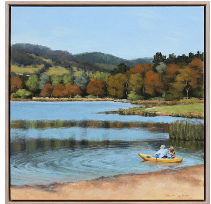
Embarking at the Lake Acrylic on canvas, 43x43cm framed $680