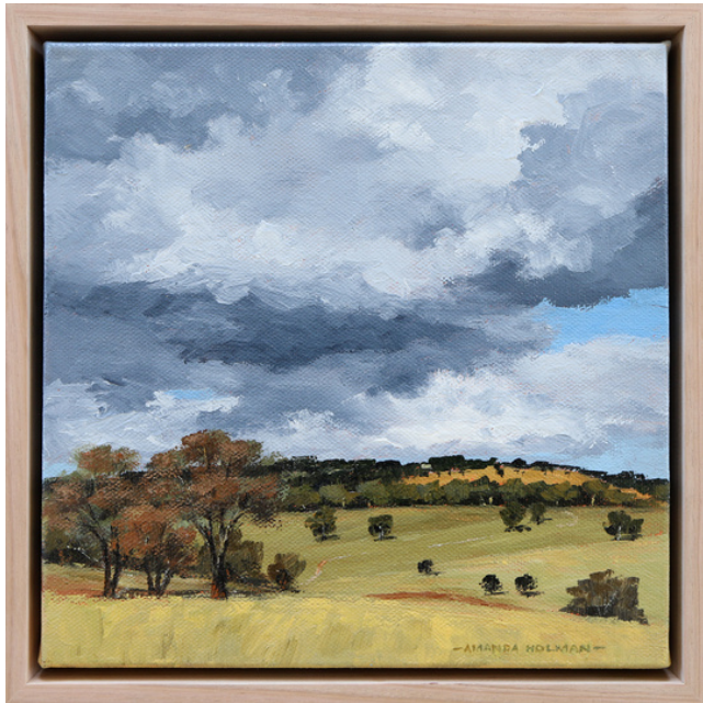
Summer Rainclouds Acrylic on canvas, 23x23cm framed $440