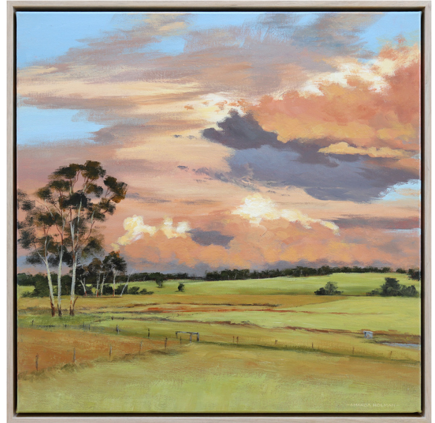
Room To Breathe