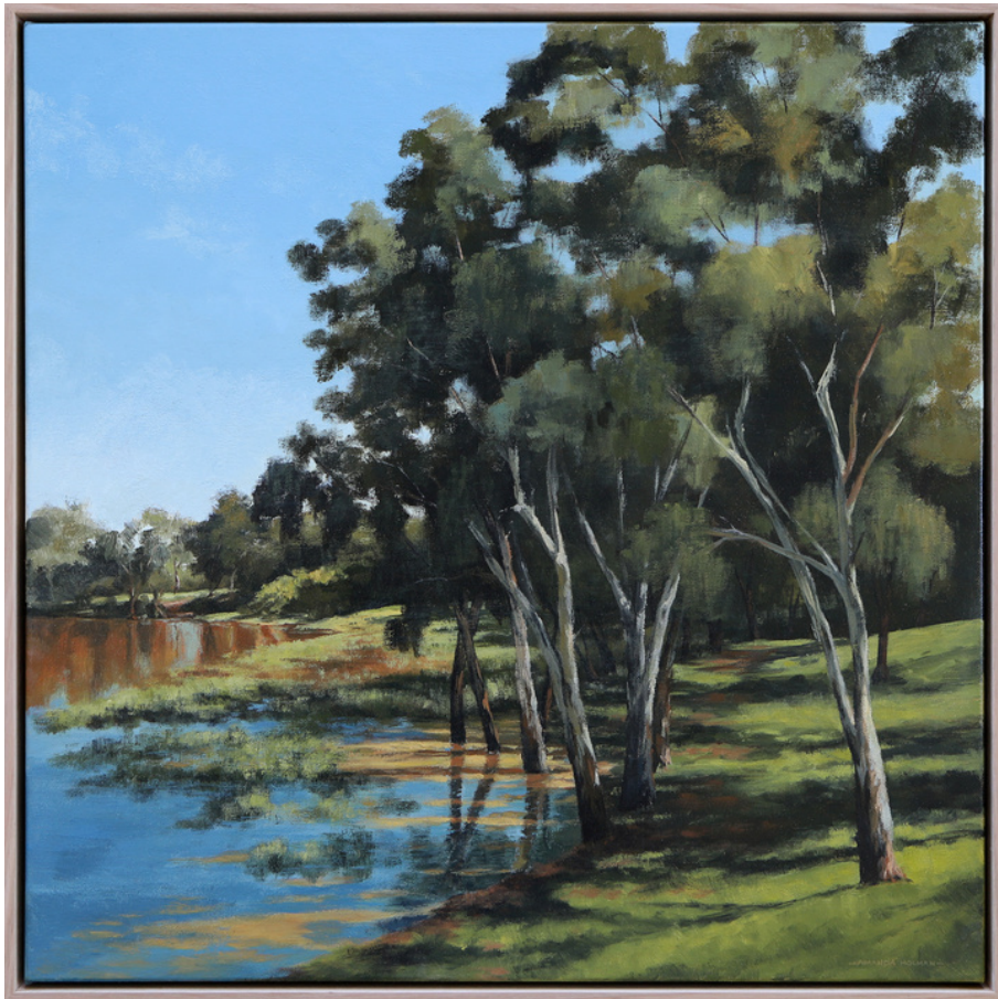
Sun-Kissed Mehi Acrylic on canvas, 64x64cm framed $980