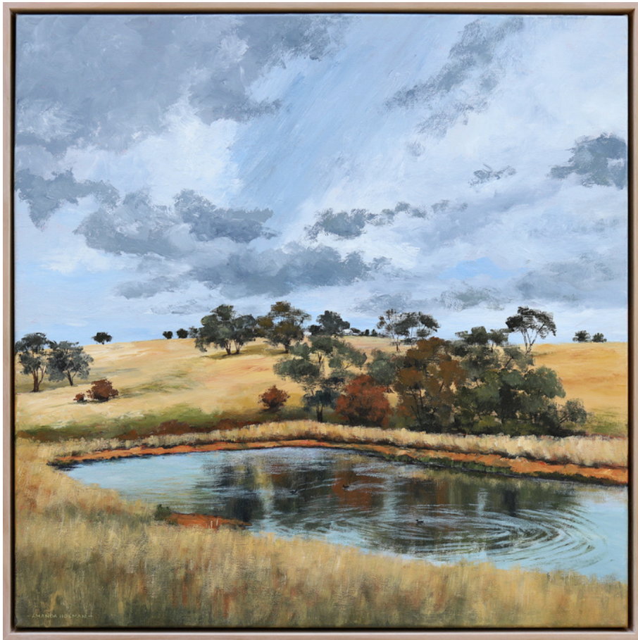
Ripples and Reflections Acrylic on canvas, 64x64cm framed $980