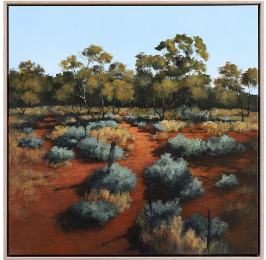
Wombat Trails & Saltbush