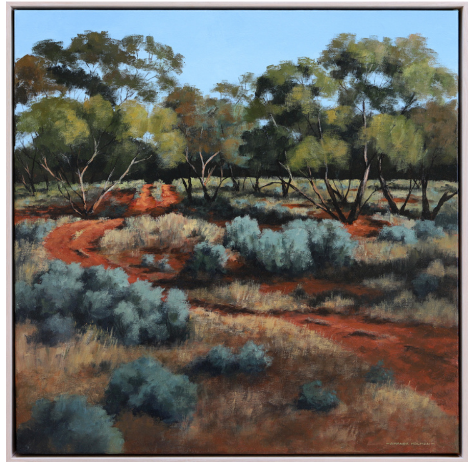
Into Saltbush Country Acrylic on canvas, 64x64cm framed $980