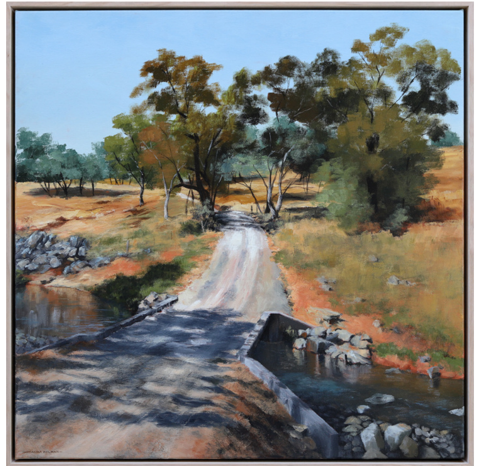
Over The Creek & Far Away Acrylic on canvas, 64x64cm framed $980