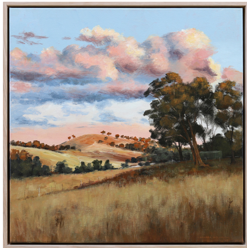
Glowing Gumtrees Acrylic on canvas, 48x48cm framed $710