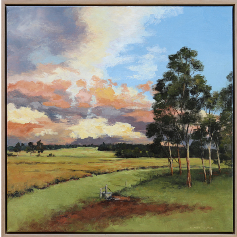
Sunset Sky over the Tea Tree Crop