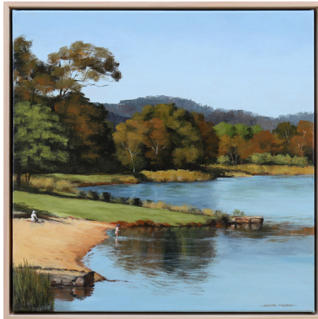
Spring Morning at Lake Canobolas Acrylic on canvas, 43x43cm framed $680