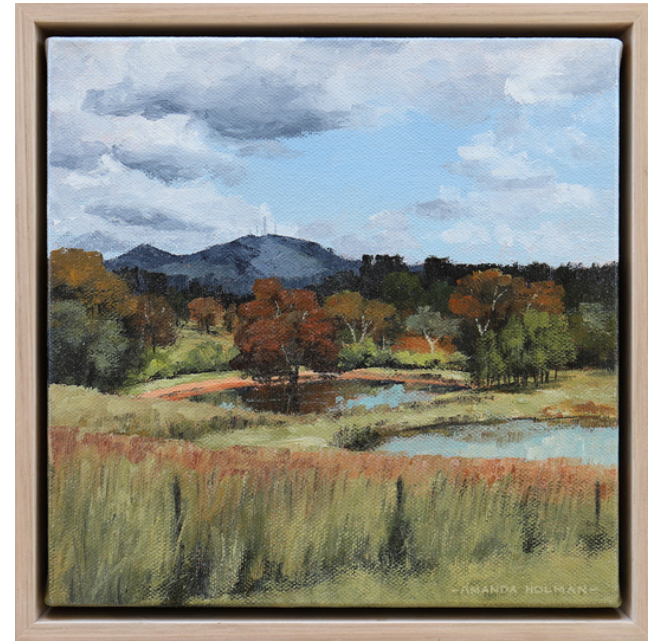
Pastures, Ponds & Mt Canobolas Acrylic on canvas, 23x23cm framed $440