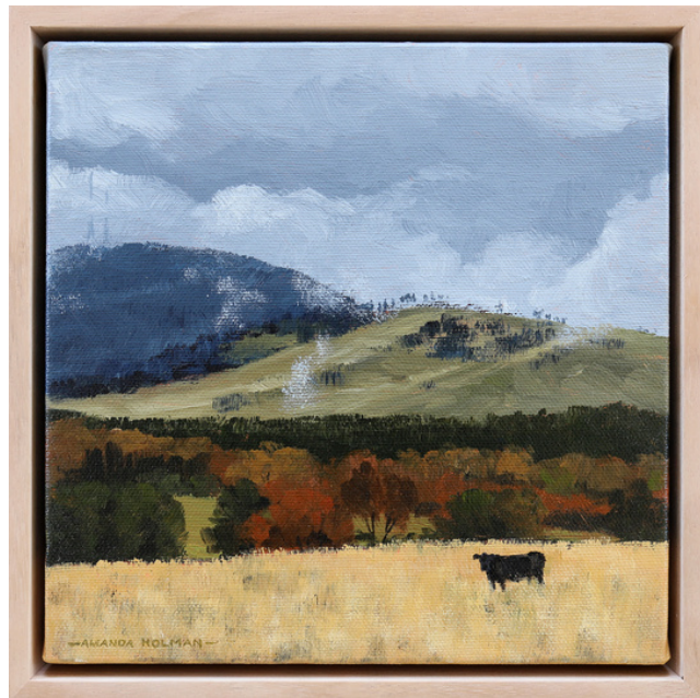
A Moo with a View - Mt Canobolas Acrylic on canvas, 23x23cm framed $440