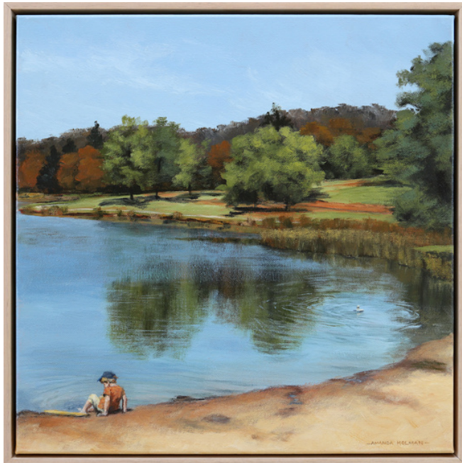
Making Waves at the Lake Acrylic on canvas, 43x43cm framed $680