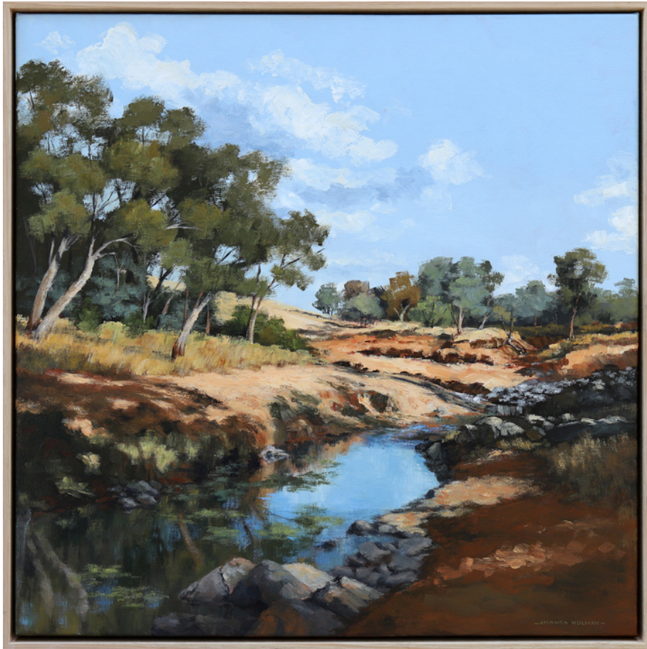
Peaceful Afternoon near Ophir