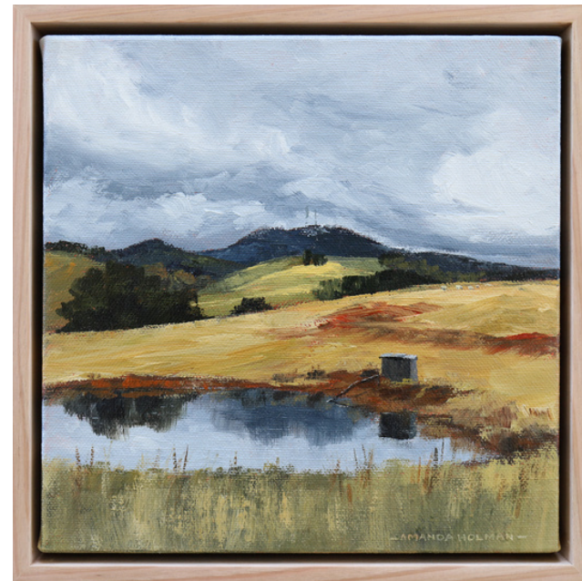
Cloudy Reflections of Mt Canobolas Acrylic on canvas, 23x23cm framed $440