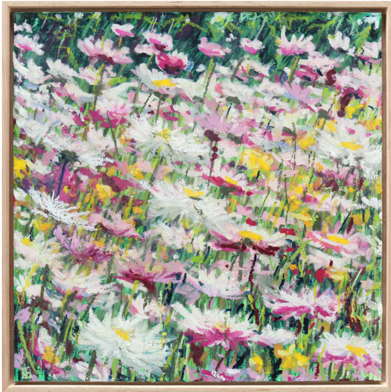
Sun Worshippers Oil pastel and cold wax on art board, 27x27cm framed $520