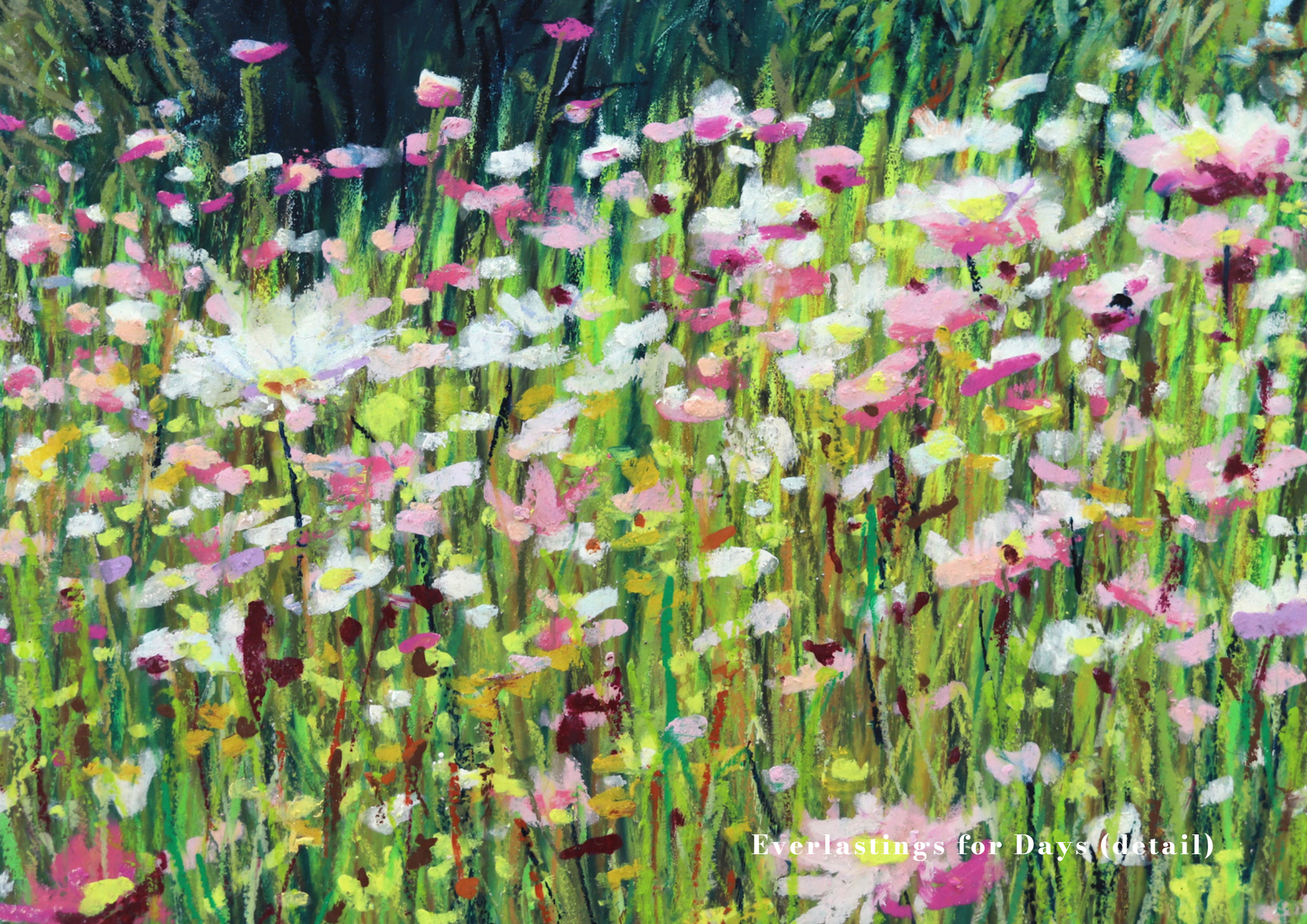
Everlastings for Days (detail)