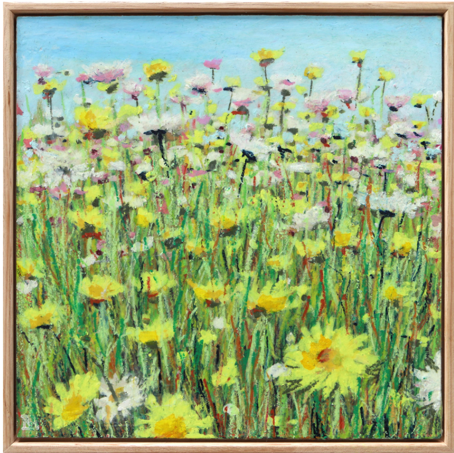
Sunshine and Happiness Oil pastel and cold wax on art board, 22x22cm framed $390