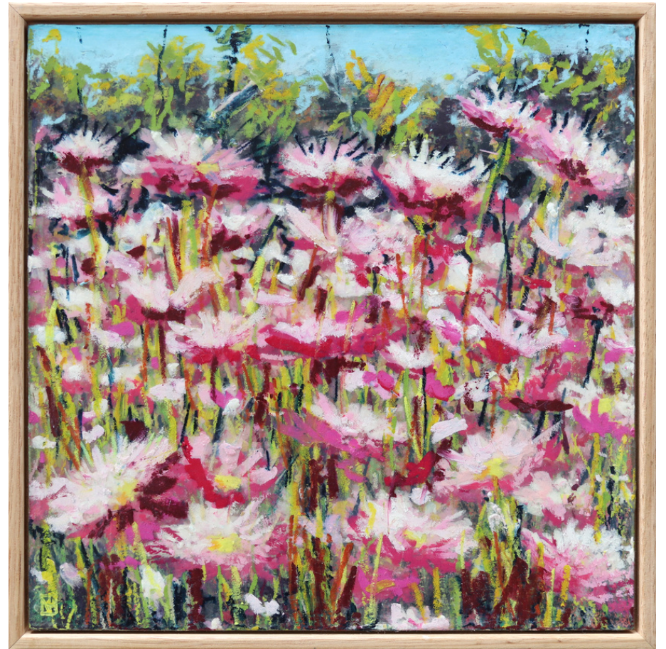
Spring Song Oil pastel and cold wax on art board, 22x22cm framed $390