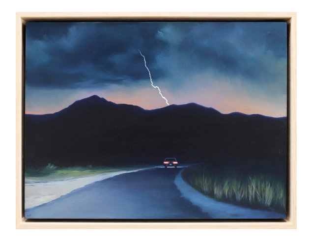
Bernie O'Neil, Tuross Lake, After Smoke, 2022 Oil on reclaimed board, 76x20.5cm $450