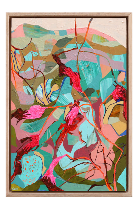
Chris de Hoog, Neon Wildflowers, 2022 Acrylic on wooden board, 30x45cm, framed $690