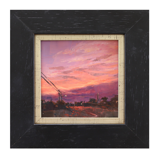
Josephine Wesley, Pink Sky At Night, 2022 Oil, 10x10cm, framed $200