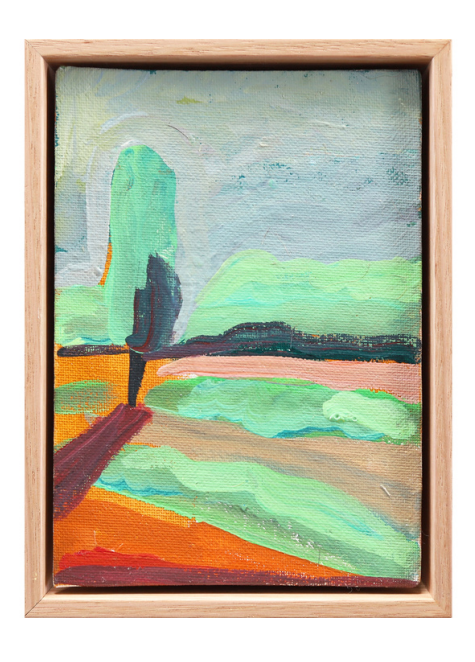
Karima Baadilla, Small Tree At Golden Hour, 2022 Acrylic on Canvas, 14.5x20cm, framed $495