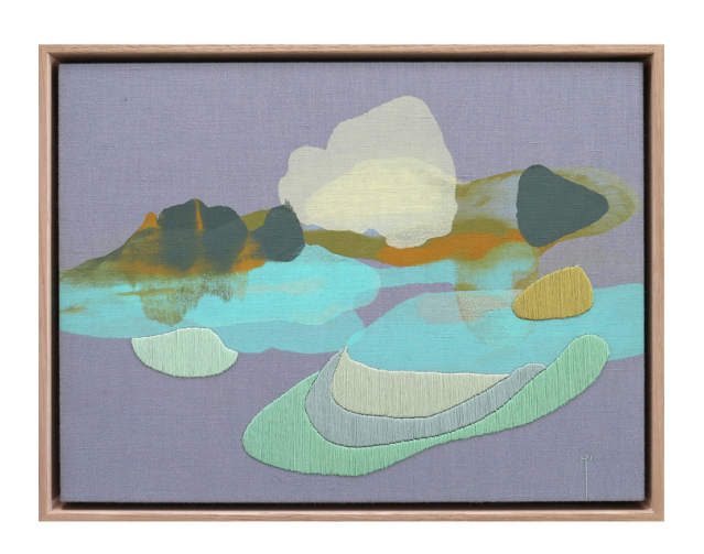
Helena Newcombe, The Land Behind, 2022 Acrylic, Embroidery thread on Linen, 30x40cm, framed $500