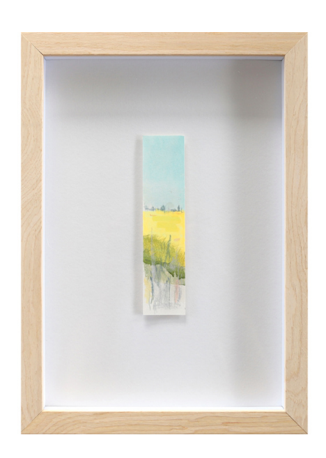
Nick Baylart, August Canola, 2022 Watercolour, coloured ink, and synthetic polymer stained kōzo tissue on paper, 30 x 21cm, framed $315