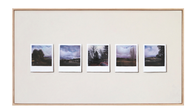
David Lake, Hunter's Moon, 2022 Oil on linen on hardboard, 66x76cm, framed $1750

Naomi Lawler, Hazy Shades of Winter, 2022 Oil on aluminium composite panel, 66.5x37.5cm, framed $2100