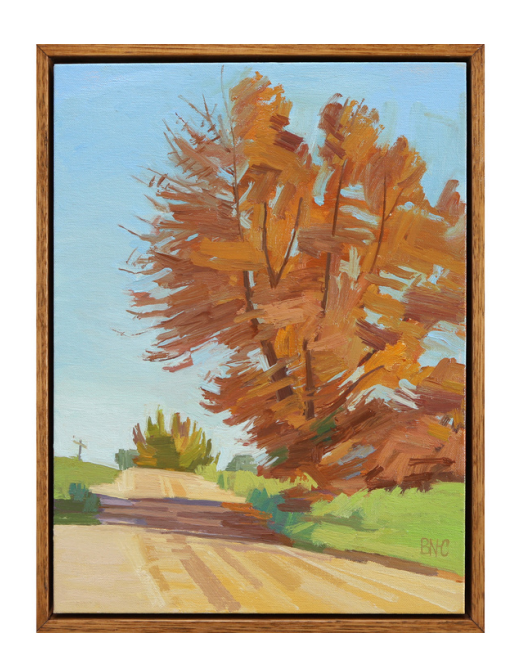
Brendan Nicholl, A Country Lane, 2022 Oils on canvas wrapped 6mm mdf 30x40cm, framed $780