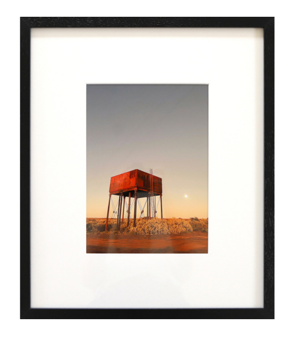
Marylou Verberne, An Unresolved Parallel, 2022 Photograph, 210mm x 290mm, framed $500