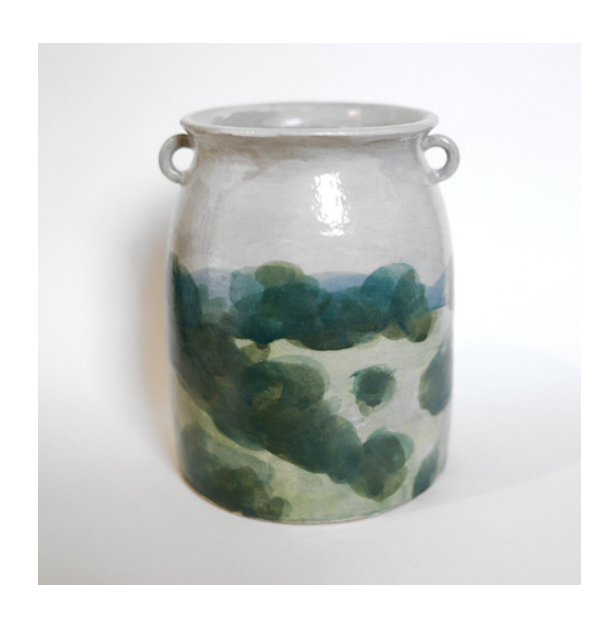
Yvette de Lacy, Mountain Landscape, 2022 Stoneware, slip, underglaze, glaze, 17x14x13cm $350