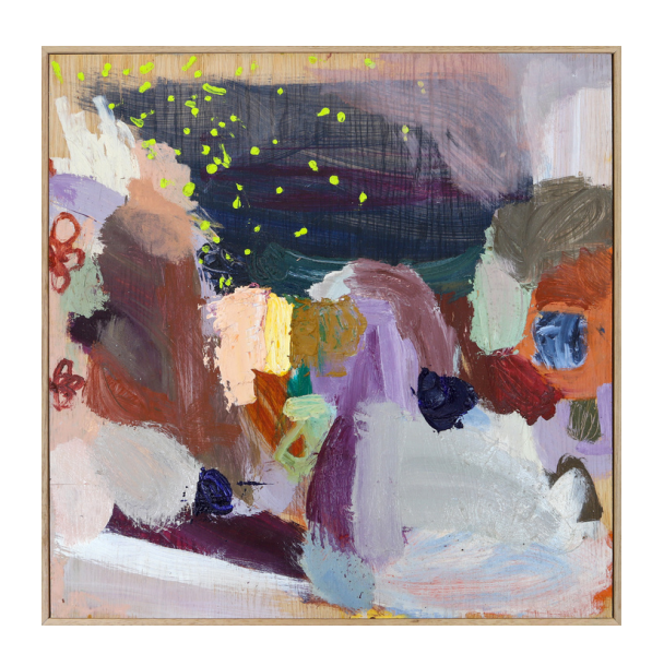
Jacky Chan, Red Eucalyptus on Mount Chalmers, 2021 Oil on board, 20x30cm, framed $600