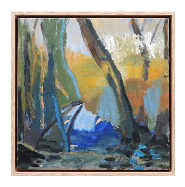
Meg Walters, We've Weathered This Storm Before, 2022 Oil on Canvas, 30x30cm, framed $1500