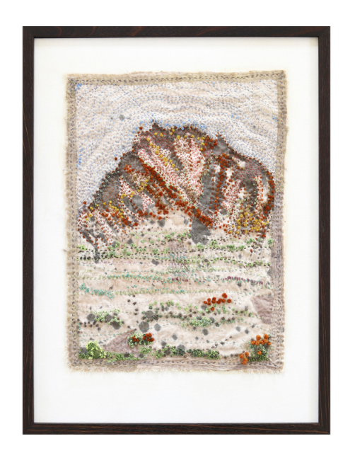
Pippita Bennett, Mount Griselda, Arkaroola, 2022 Linen, wool, cotton and silk, 61x46cm, framed $800