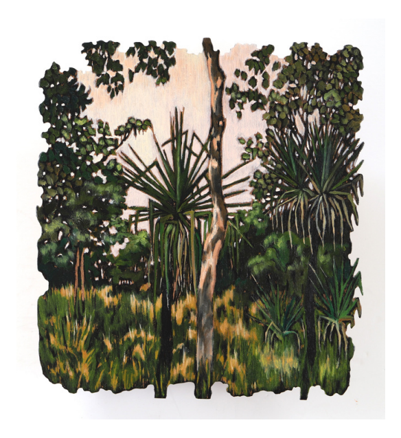
Sonia Martignon, Stillness in the Blink of Twilight, 2022 Oil and tusche on hand cut plywood, 27x24.5cm, framed $500